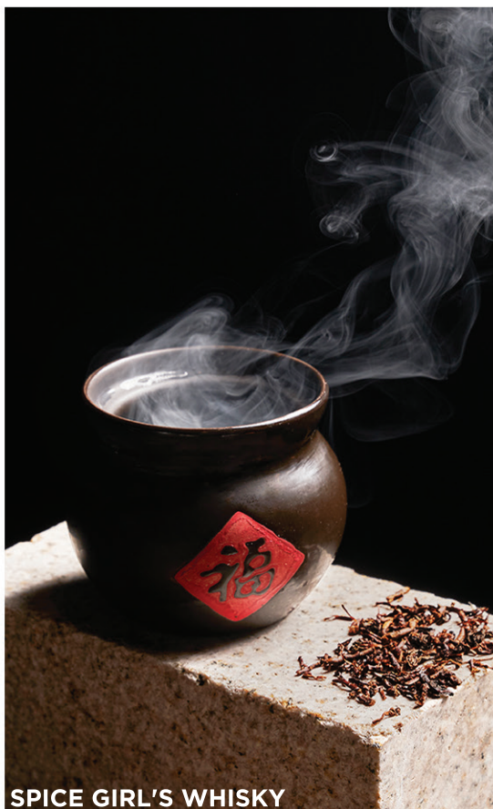
SPICE GIRL'S WHISKY