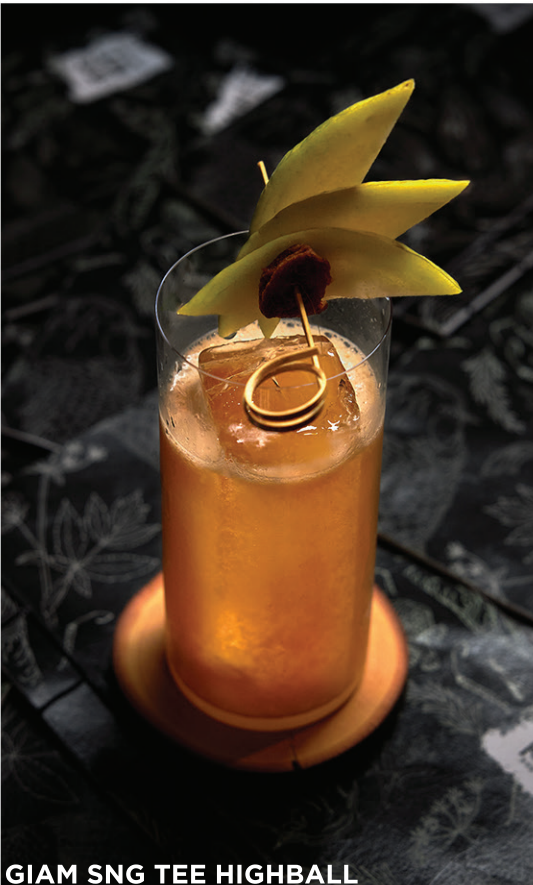
GIAM SNG TEE HIGHBALL