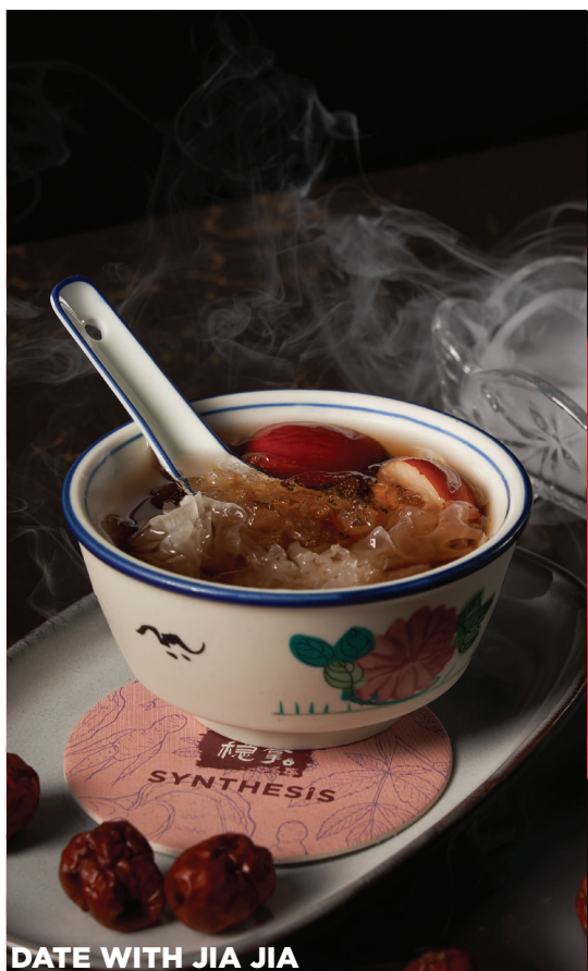
DATE WITH JIA JIA