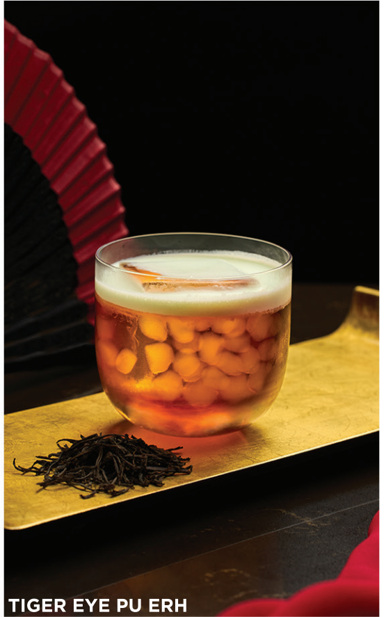
TIGER EYE PU ERH