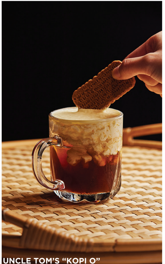
UNCLE TOM'S "KOPI O"